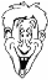
A. AUTHOR1 Organisation 1 Place 1