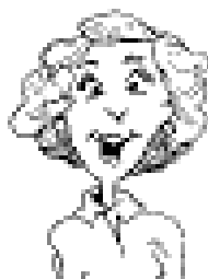
B. AUTHOR2 Organisation 2 Place 2