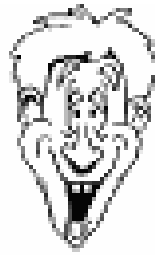
C. AUTHOR3 Organisation 3 Place 3